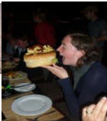
On 19th May 2011 it was the third and final day of the African Feeling Tour Group at Inkwenkwezi