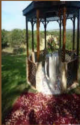
The chapel where we say I do ...

Did you know that the Likkwaan is the longest lizard in africa after the Nile monitor