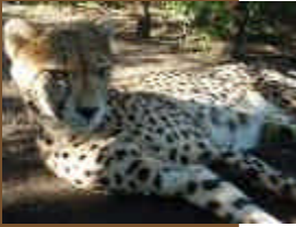
Ikwezi the cheetah absorbing all the attention

The morning arose on the 18th May 2011 , day two of the group's visit . The day has juts begun and the group was ready for action.